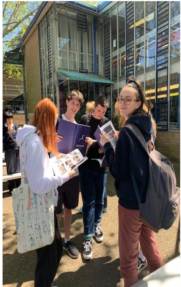
Year 12 students enjoying reading their Yearbook.

Look after yourselves and make sure that you maintain good friendships. I believe the world will be in good hands when you become the leaders of business, work and politics over the next 30 years. Remember you are now a member of the BLACKWATTLE BAY ALUMNI.