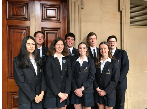
Year 12 School Leaders with our new School Leaders for 2020 at Graduation