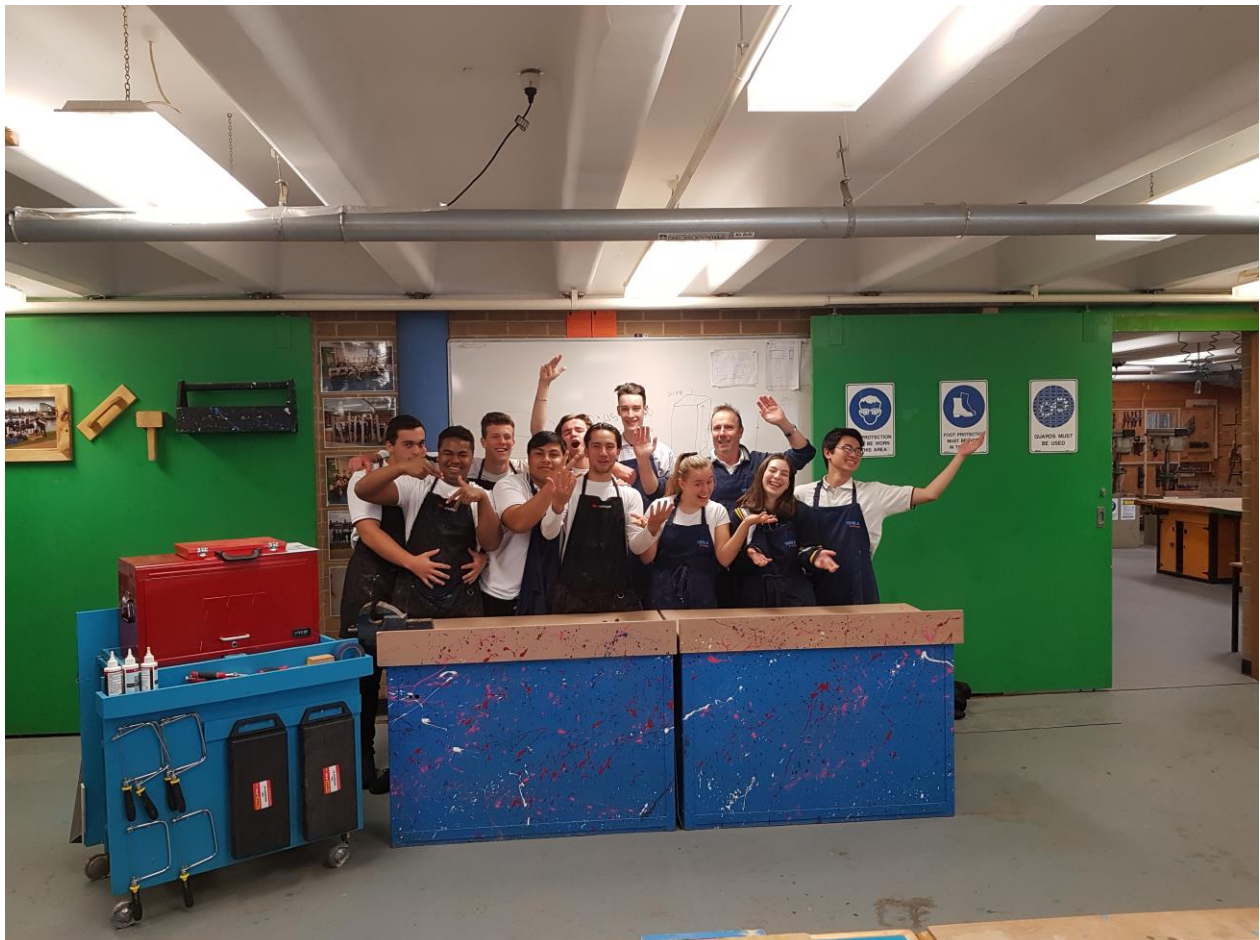
Year 12 Construction students posing with their gifts to their teachers – a refurbished teacher’s desk and a D & T work trolley.