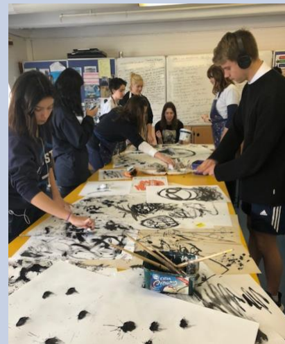
Experimental drawings by Year 11 Visual Arts students.