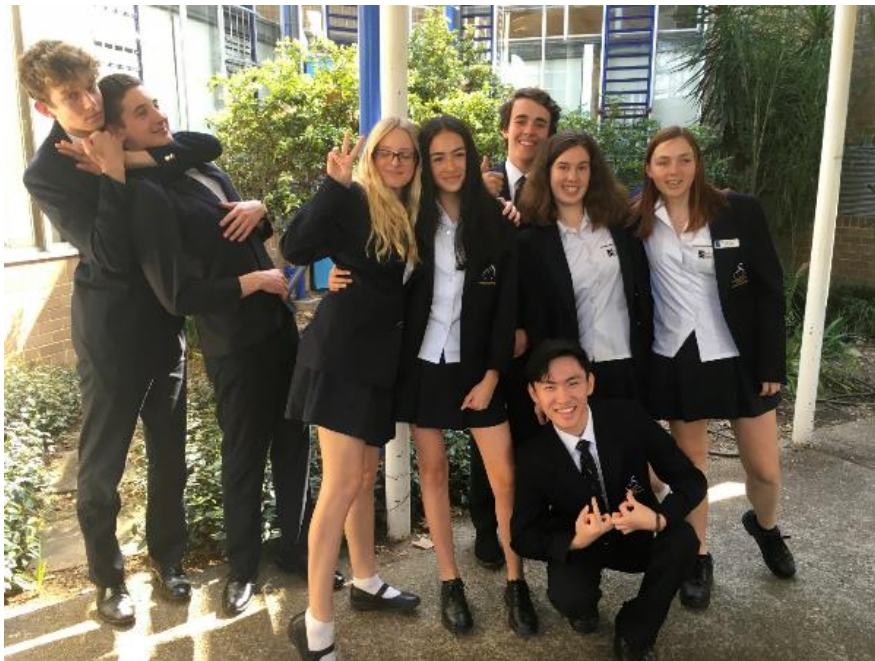
"Passing of the baton" Year 12 school leaders hand over to our new school leaders for 2019.