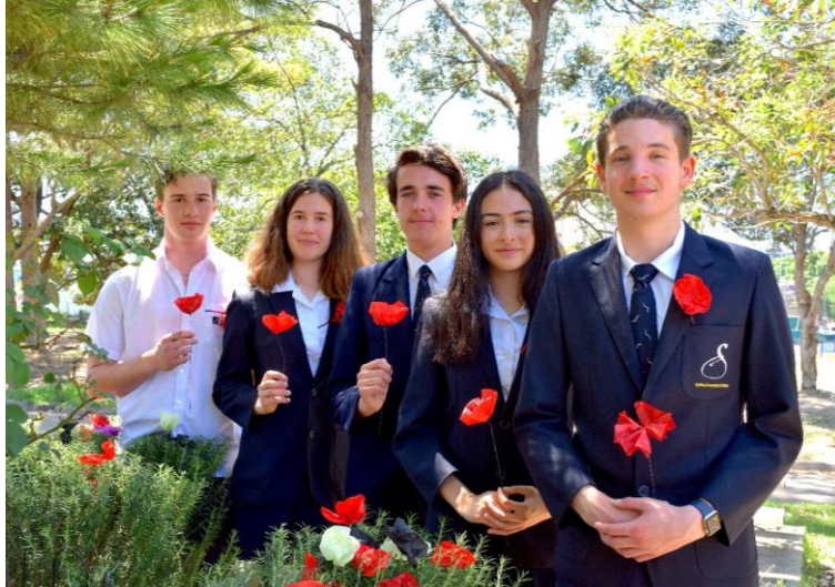
School leaders with poppies at the Remembrance garden.