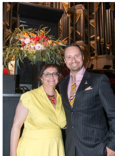
The hard-working Year Advisers finally relaxed after all 320 students graduated on 28 September 2018 at Sydney Town Hall