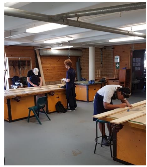
Year 12 Construction – First day in the workshop.