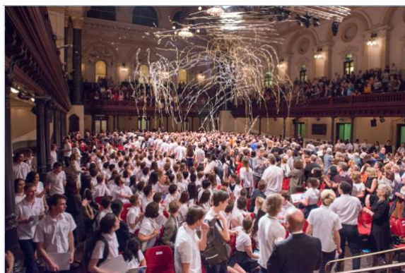
The Wow Factor at Graduation