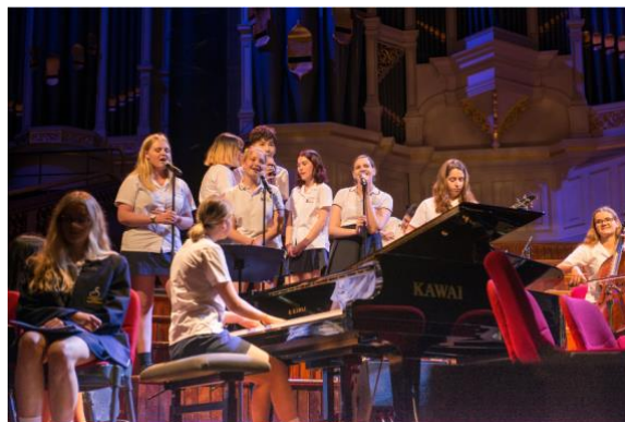
Year 12 2018 Music Items at Graduation

At the start of Term 4 we welcomed our new Year 12 students back to school and spent the first two days in the very successful Year 12 Learning Conference. We had some fantastic speakers and workshops and students were engaged and focused during the conference. I would like to acknowledge and thank the teachers who presented workshops over these two days.