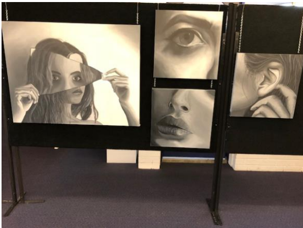
Left: Sam Tylor's striking images on identity