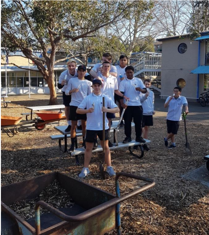
Construction class fixing up the playground.