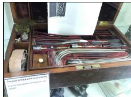
Above: Display case of olden-day surgical amputation instruments.