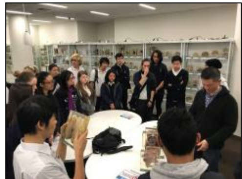
Above: Students observe human body remains that have become infected by pathogens.