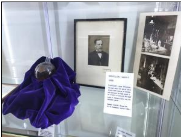
Above: A glass cabinet display of some broth that was used by Louis Pasteur in his famous experiments that disproved the olden-day belief that microbes could spontaneously generate out of thin air. His work led to the process of the Pasteurisation of milk