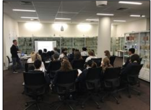
Above: Students learn about infectious and non-infectious diseases at Sydney Uni