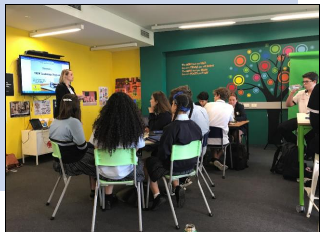
Above: SRC contributing towards a leadership conference, held by UNSW.