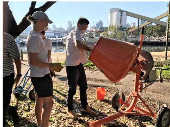
Teamwork: Mixing the concrete for pouring.