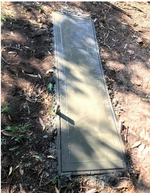
The Final Slab waiting to dry!

The year 12 VET Construction class used their new skills to level, and erect formwork so they could lay a small slab near the oval. This slab will be used for the new bicycle rack, soon to be installed for all students to use.