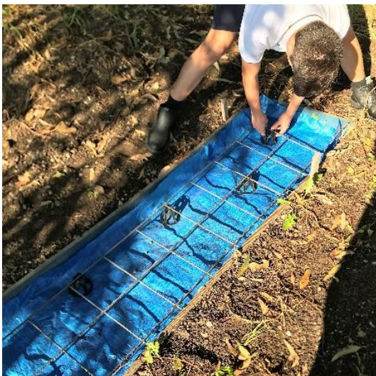
Laying the formwork, waterproofing and reinforcing bar for strength.